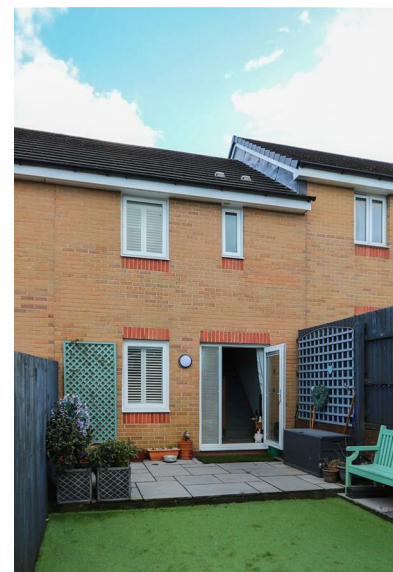
White Farm, Barry, CF62 9EW